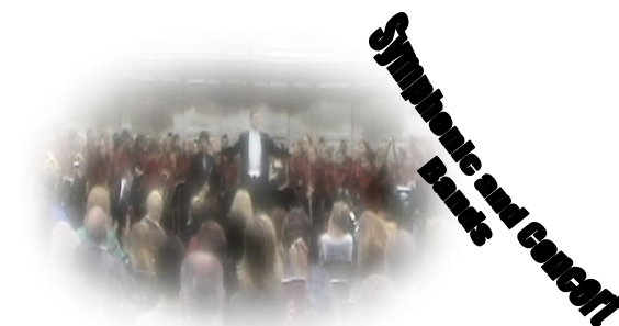
Symphonic and Concert Bands